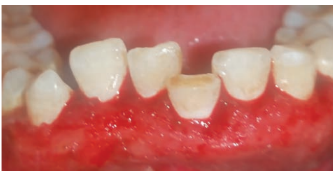
Fig. 2: Immediate postoperative view