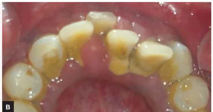
Figs 1A and B: Preoperative intraoral view: Facial (left) and lingual (right)