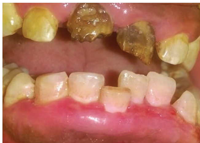
Fig. 5: Ten days postoperative view