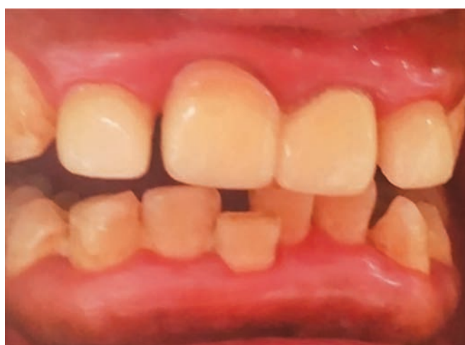
Fig. 6: Two months postoperative view

Gingival enlargement can be classified according to etiologic factors and pathologic changes 9 :