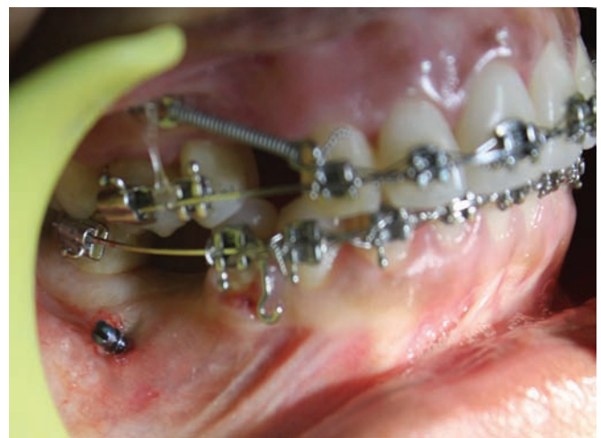
Fig. 5: Reinsertion after 7 days