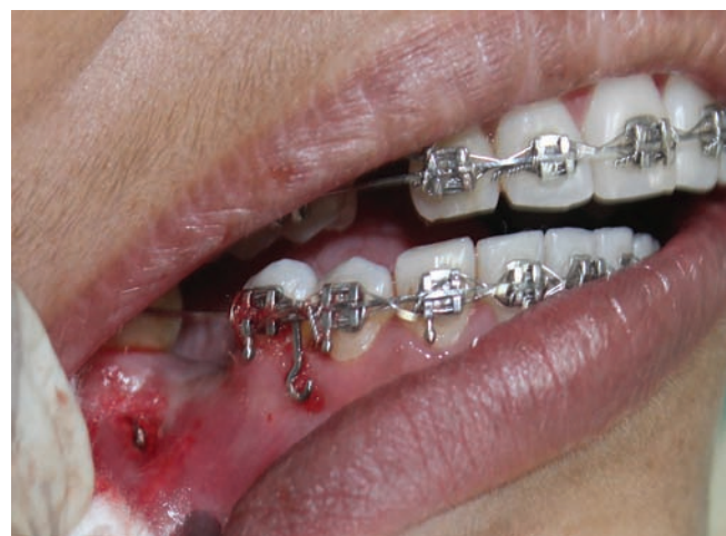
Fig. 1: Fractured TAD in 46 region

A 26-year-old female patient reported to our orthodontic clinic with chief complaint of protruded front teeth. On examination, we found missing 36, 45, 46 and planned for extraction of two upper first premolar tooth and closure of all the spaces left out of the lower molar spaces for prosthodontic rehabilitation. For anchorage, the plan was to have four miniscrews (two in upper between second premolar and first molar, two in lower in edentulous area). After alignment and leveling, miniscrews in upper region were placed and same in edentulous 36 area. The inadvertent accident occurred during placing the TAD in 46 region (Fig. 1). When trying to insert the implant 1.5 × 9 mm, it fractured after insertion of 5 mm.