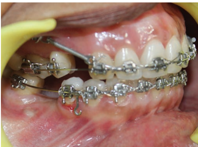
Fig. 4: Healing after 4 days