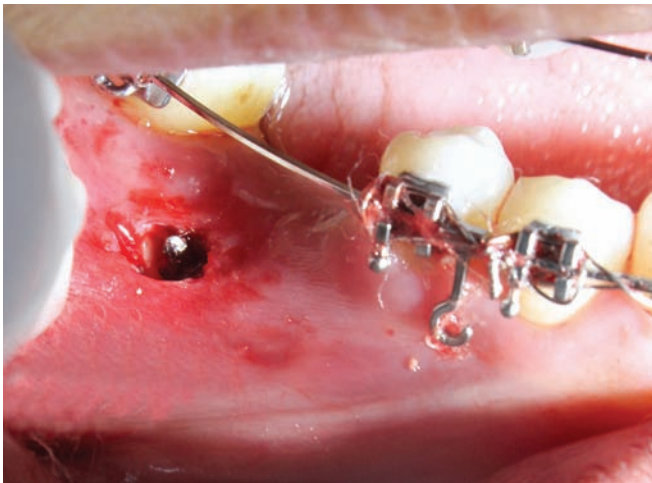
Fig. 2: Circular groove in TAD periphery