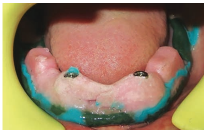
Fig. 5: Impression copings splinted with acrylic resin