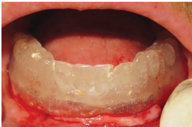
Fig. 2: Surgical stent placed intraorally