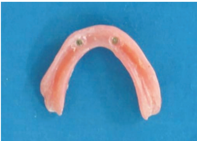
Fig. 7: Intaglio surface of processed denture showing incorporated stainless steel housings with white retentive caps

implants; a dental prosthesis that covers and is partially supported by natural teeth, natural tooth roots, and/or dental implant (Glossary of Prosthodontic Terms 8). If an edentulous patient is willing to remain with a removable prosthesis, an overdenture is often the treatment of