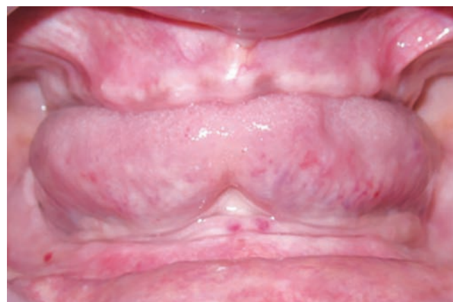
Fig. 1: Preoperative intraoral view

Diagnostic impressions were made. Diagnostic orthopantomogram (OPG) and casts, records were studied. Implant placement was planned at B and D positions after obtaining consent from patient (Misch's overdenture options – OD1). 2 Treatment was divided into three phases: (1) diagnostic denture fabrication, (2) implant placement, and (3) final prosthesis fabrication.