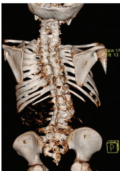
Fig. 3: Complex congenital scoliosis with rib fusion

Congenital cardiac abnormalities are identifiable in 7 to 26%. 14-16 In one series, 50% of the cardiac anomalies needed medical or surgical treatment. 16 Genitourinary anomalies are found in 18 to 21%. 15,16 In most cases, the genitourinary abnormalities are benign, but up to 33% may need treatment. 16 Around 16 to 35% of patients have an associated musculoskeletal abnormality. 15,16 Cervical and upper thoracic defects had a strong association with upper limb hypoplasia and Sprengel's deformity. 15 Cranial nerve palsy has been reported in 11% of patients with a strong association with concurrent facial anomalies. 15 Gastrointestinal, tracheoesophageal, and pulmonary abnormalities are less common.