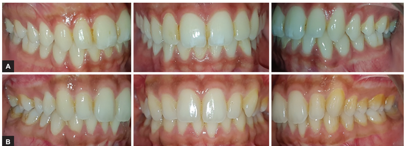
Figs 1A and B: (A) Discoloration due to mouthrinse A, 0.2% CHX with ADS; and (B) mouthrinse B, 0.2% CHX

SD: Standard deviation; SEM: Standard error of mean