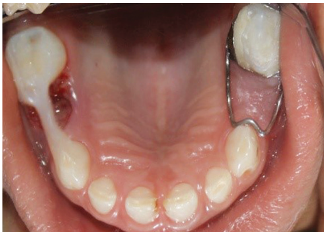
Fig. 1: Postoperative view showing band-and-loop space maintainer (right side) and GFRC space maintainer (left side)