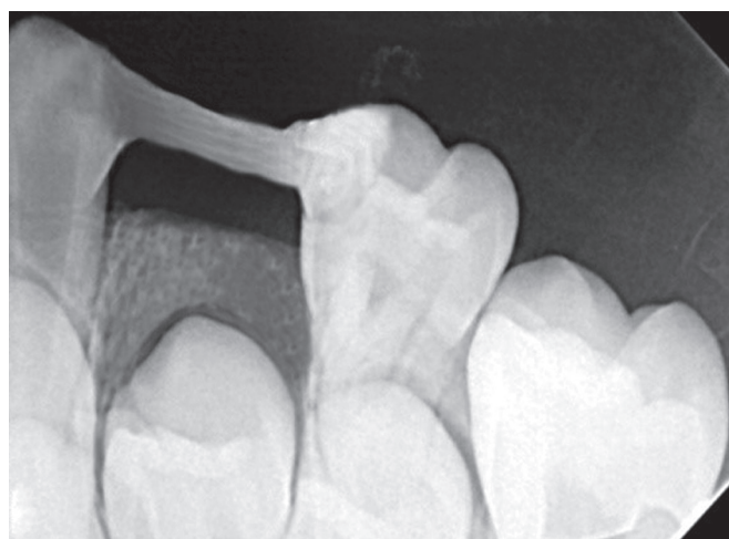
Fig. 2: Radiographic image of GFRC space maintainer at follow-up

Based on statistical analysis, overall success rate of group I was found to be 69.2% and of group II was 95.7% ( p = 0.026 ), which was statistically significant (Table 1 and Graph 1). The GFRC space maintainers showed an overall success rate compared with band-and-loop space maintainers. Based on statistical analysis of inter- and intragroup comparison at 1, 3, 6, and 12 months interval, distortion/dislodgment of the loop or the fiber frame, fracture of loop or fiber frame, and space loss were found statistically insignificant. Gingival health observed between groups I and II at 12 months follow-up was found statistically significant ( p = 0.026 ).