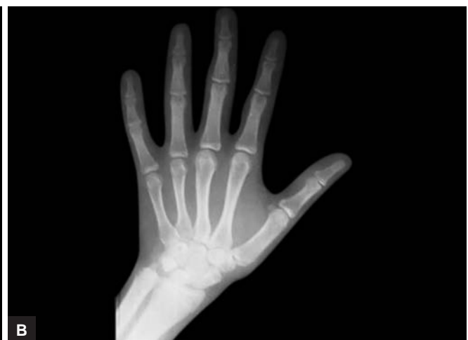
Figs 4A and B: Coincidence of (A) stage G with capping and (B) stage H with fusion

Stages E and F are coincident with the epiphyseal widening in the third finger proximal, middle phalanx and middle phalanx of the fifth finger. Test of significance showed significance at p<0.01.