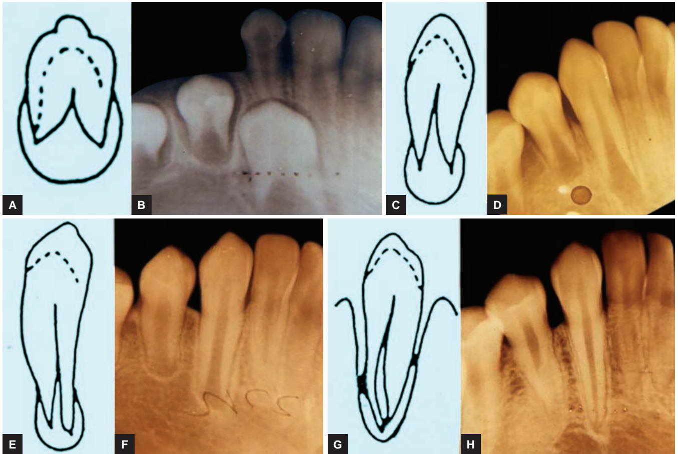
Figs 3A to H: Demirjian's stages of mandibular canine calcification. Stage E (A and B): The walls of the pulp chamber from straight lines whose continuity is broken by the presence of the pulp horn. The root length is less than the crown height. Stage F (C and D): The walls of the pulp chamber now form a more or less isosceles triangle. The apex ends in a funnel shape. The root length is equal to or greater than the crown height. Stage G (E and F): The walls of the root canal are now parallel and its apical end still partially open. Stage H (G and H): The apical end of the root canal is completely closed. The periodontal membrane has a uniform width around the root and the apex

standard deviation of 2.18. The test of significance was not significant.