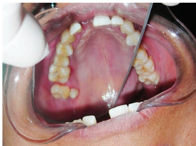
Fig. 5: Clinical picture of supernumerary tooth