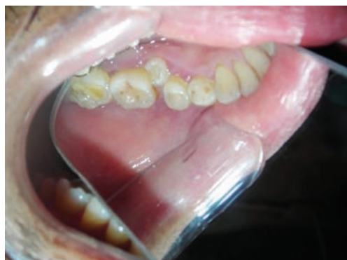
Fig. 7: Supernumerary tooth in lower right mandibular quadrant