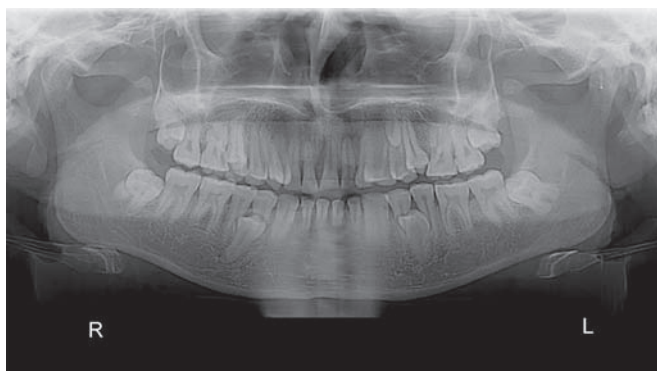
Fig. 6: Panoramic radiograph showing five supernumerary tooth