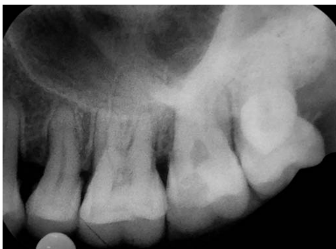
Fig. 4: X-ray of upper left maxillary second molar with supernumerary tooth

A 25-year-old male patient reported with the chief complaint of difficulty in mastication because of too many teeth in his mouth. On examination, it was seen that there was an additional premolar in upper right and left quadrants and lower right and left quadrants. Since so many supernumerary premolars were seen in the patient, a panoramic X-ray was taken (Figs 6 to 9). It showed one more impacted premolar. Thus, a total of five additional premolars were seen in the patient.