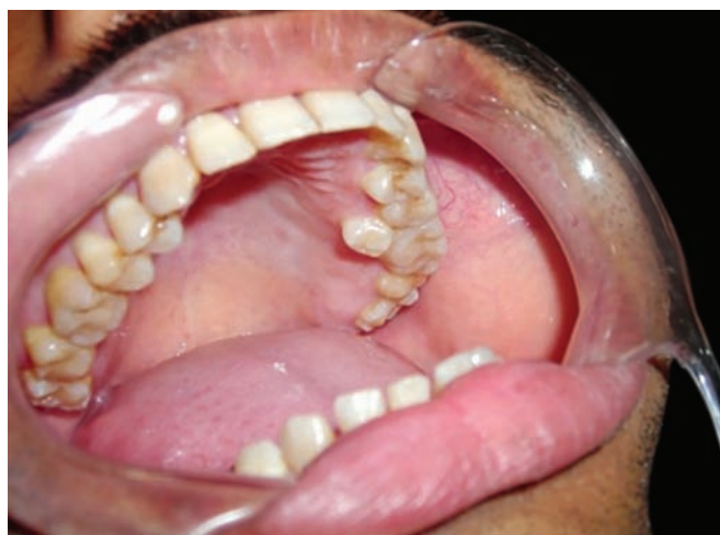
Fig. 8: Supernumerary tooth in upper left maxillary quadrant