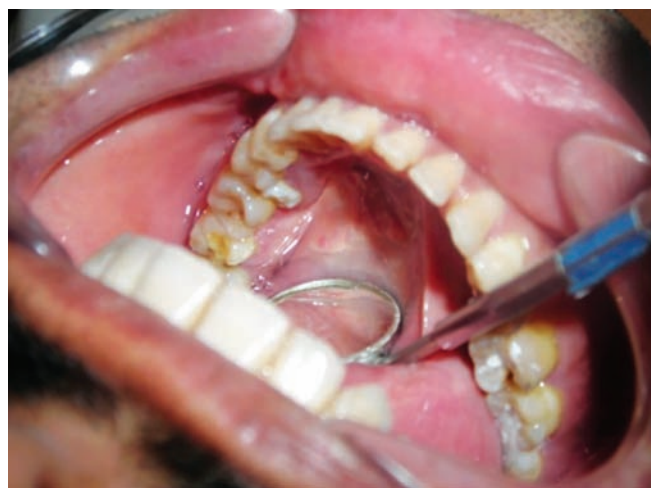
Fig. 9: Supernumerary tooth in lower left mandibular quadrant