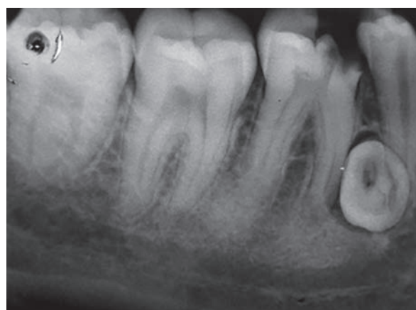
Fig. 1: X-ray of lower right first mandibular molar showing deep carious lesion along with incompletely developed supernumerary tooth

A 28-year-old female reported to the Department of Conservative Dentistry and Endodontics with the chief complaint of pain in the lower right first mandibular molar. On examination, deep proximal caries was seen with mandibular first molar. The tooth was tender on percussion. Hence, an intraoral periapical X-ray was advised to the patient. The X-ray showed deep carious lesion with first mandibular molar, along with an incompletely developed supernumerary located between roots of premolar and molars (Fig. 1). Root canal treatment was planned for mandibular first molar. After opening the pulp chamber, the pulp was extirpated, and diagnostic X-rays were taken. Irrigation was done with 5.25% sodium hypochlorite.