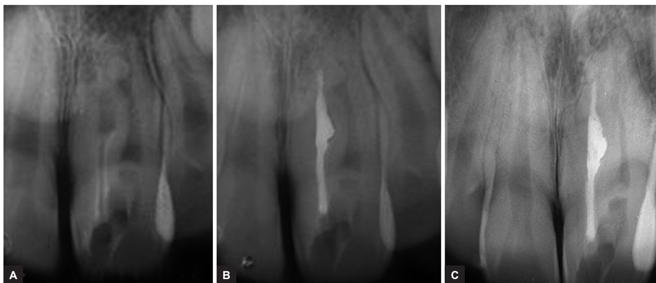
Figs 2A to C: Operative sequence of conventional endodontic treatment of dens invaginatus and conservative treatment (pulpotomy) of main root canal. Final procedures and follow-up: (A) Dentin bridge of main root and dens invaginatus medication; (B) dens invaginatus filling; and (C) 21 years follow-up

hydroxyl ions and the action of these ions on tissues and bacteria explain the biological and antimicrobial properties of this substance. 12,13 The calcium hydroxide induces the deposition of a hard tissue bridge on pulpal and periodontal connective tissue. 12,13 It was also used in contact with the remaining vital pulp, for pulpotomy procedure. Dentin bridge is consistently formed, and the remaining pulp is preserved.