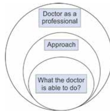
Fig. 2: Three circle framework for learning outcomes