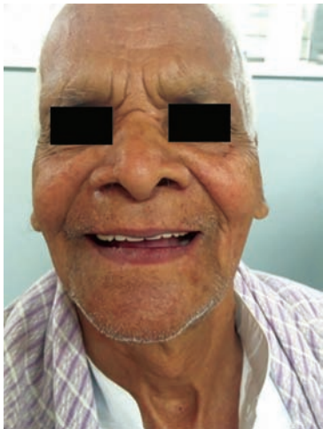
Fig. 7: Finished complete intraoral dentures