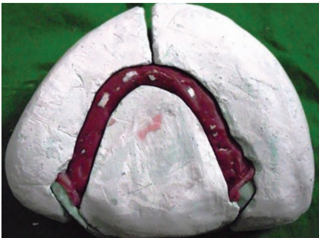
Fig. 5: Plaster indices around molded impression compound