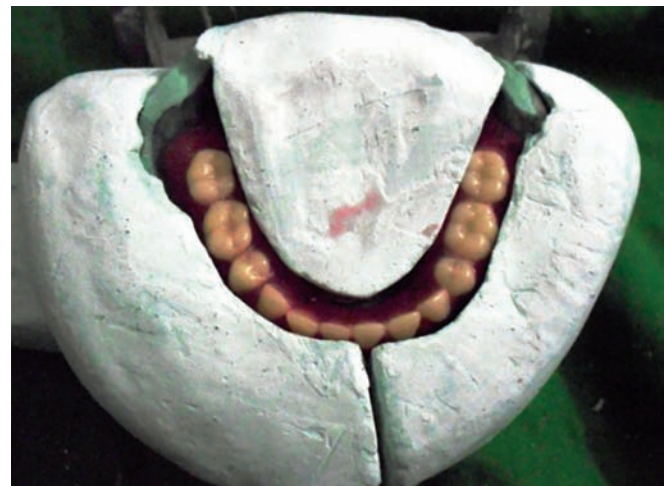
Fig. 6: Teeth arrangement according to plaster indice

pout/purse lips, count from 60 to 70, talk aloud, pronounce the vowels, sip water, swallow, slightly protrude the tongue and lick the lips. These actions were repeated for 10 minutes until the compound became hard.