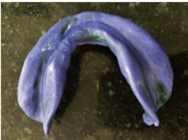
Fig. 3: Mandibular wash impressions