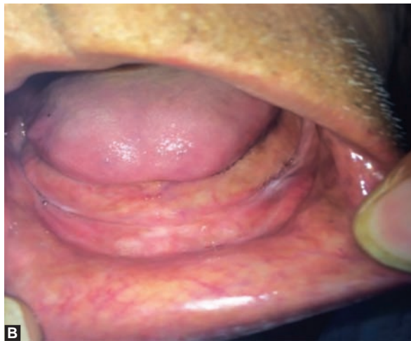
Figs 2A and B: Resorbed maxillary and mandibular ridges