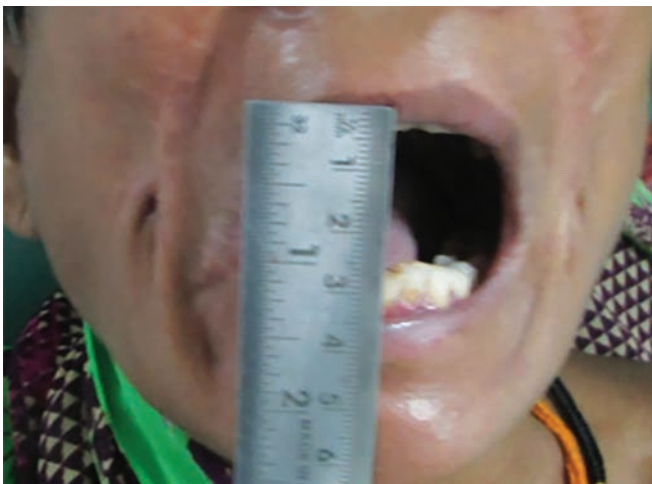
Fig. 5: Six months postoperation

inferiorly based nasolabial flap was deepithelialized in a triangular fashion (Fig. 4).