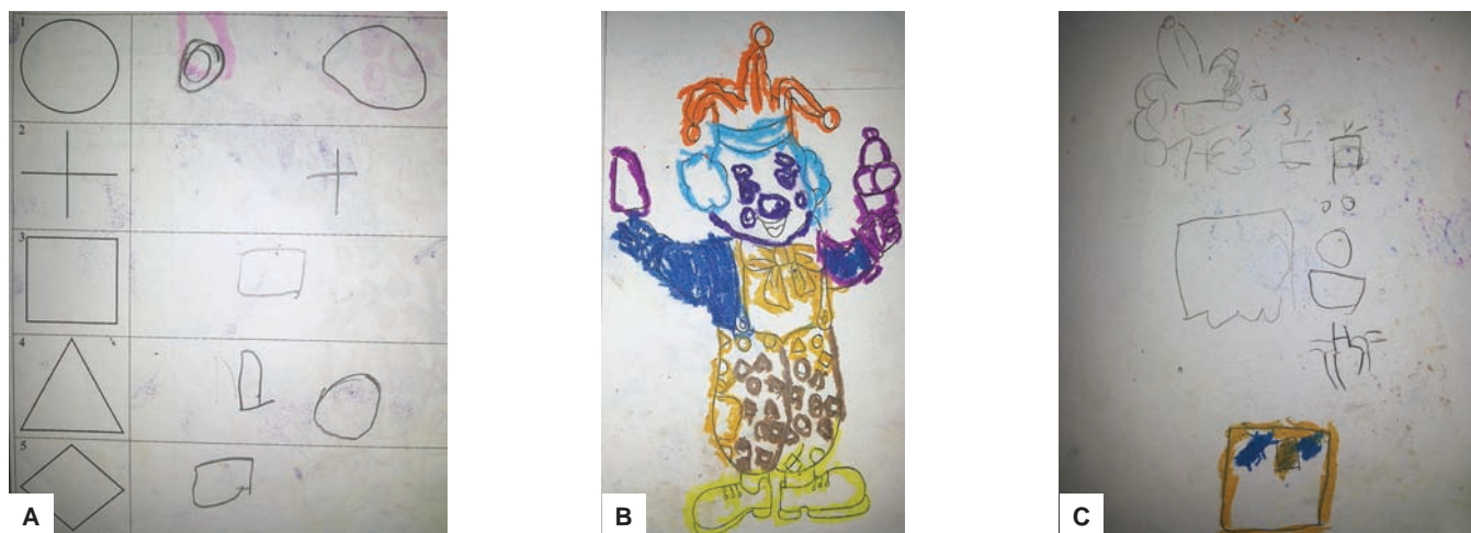
Figs 2A to C: (A) Geometric copy drawings done by a 9-year-old female patient displaying Frankl's negative behavior during dental treatment. These are at the level of copy drawing expected from 4½- to 5½-year age group; (B) coloring task left incomplete by the same patient as in 2A; and (C) no clarity of thought, disjointed figures, and no resemblance to any object in freehand pencil drawings done by the same patient who has drawn in 2A and 2B