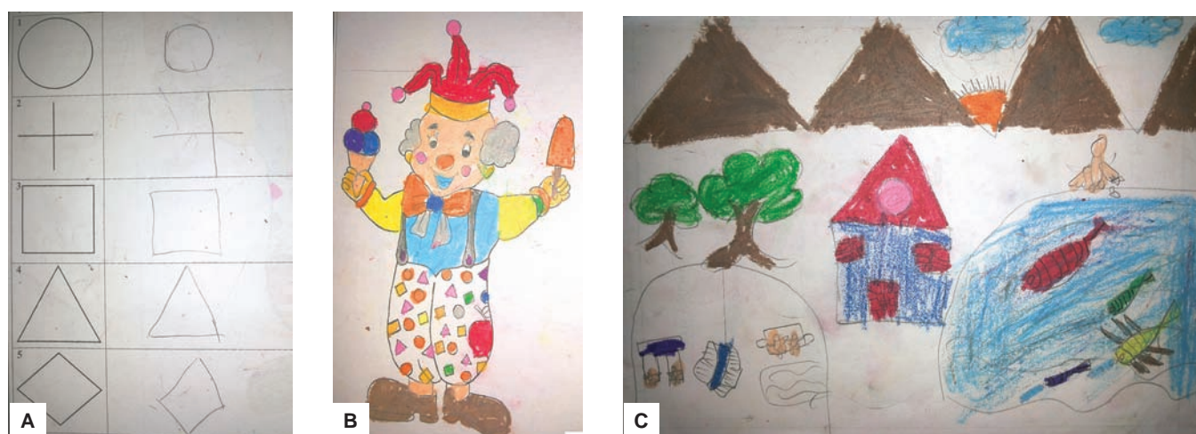
Figs 3A to C: (A) Geometric copy drawings done by a 9-year-old female patient displaying Frankl's positive behavior during dental treatment, showing clear, bold, age-appropriate pattern; (B) neatly completed coloring task using multiple colors by the same patients as in 3A; and (C) clarity of thought and proportion in detailing with multiple human figures drawn by the same patient as in 3A and 3B

are in obvious contrast to the ones drawn by another 9-year-old female patient with Frankl's positive behavior (Figs 3A to C).