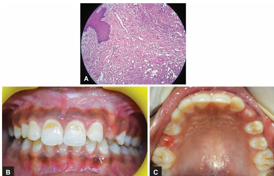
Figs 3A to C: Postoperative pictures: (A) Histopathological picture of the excised tissue; (B) and (C) 6 months postoperative image showing normal gingiva erupting permanent teeth

Microscopic evaluation (Fig. 3A) showed parakeratinized stratified squamous epithelium of variable thickness. Underlying connective tissue showed dense diffuse chronic inflammatory cell infiltration, the connective tissue stroma was edematous, moderately dense fibrocellular, and excessively vascular, which lead to confirmatory diagnosis of pyogenic granuloma. Postexcision period (Figs 3B and C) was uneventful with no evidence of recurrence.