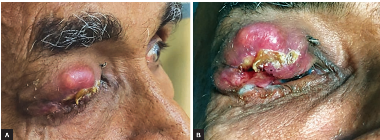
Figs 1A and B: (A) Extent of lesion; and (B) undersurface of the lesion