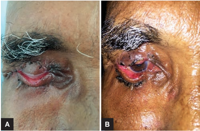
Figs 4A and B: (A) After stage 1 surgery; (B) after stage 2 surgery

ophthalmologist in view of emergent requirements. It is required in various clinical conditions like lid tumors and malignancies, traumatic lid defects, colobomas, burns, postirradiation, and severe variant of herpes zoster ophthalmicus. 6