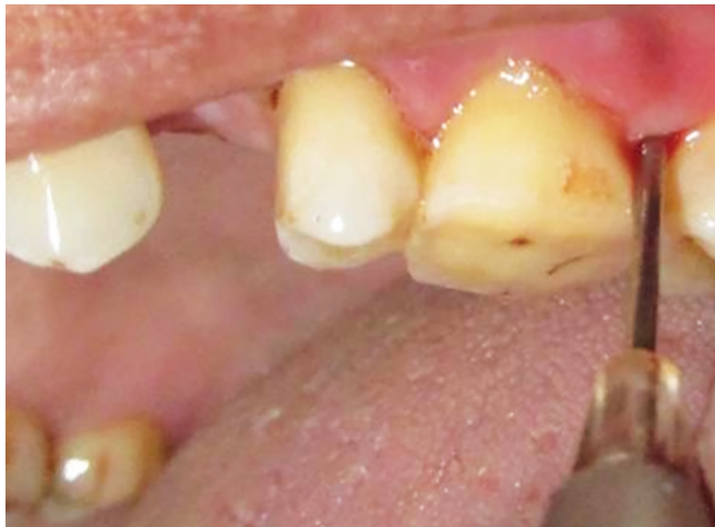
Fig. 1: Lazing

was irrigated with normal saline after each session of irradiation.