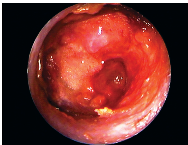
Fig. 1: Laparoscopy picture showing only upper surface of uterus visualized surrounded all over by adhesions

Laparotomy was done to rule out any vesico-uterine fistula (VUF) and dissecting uterus. In the same sitting the