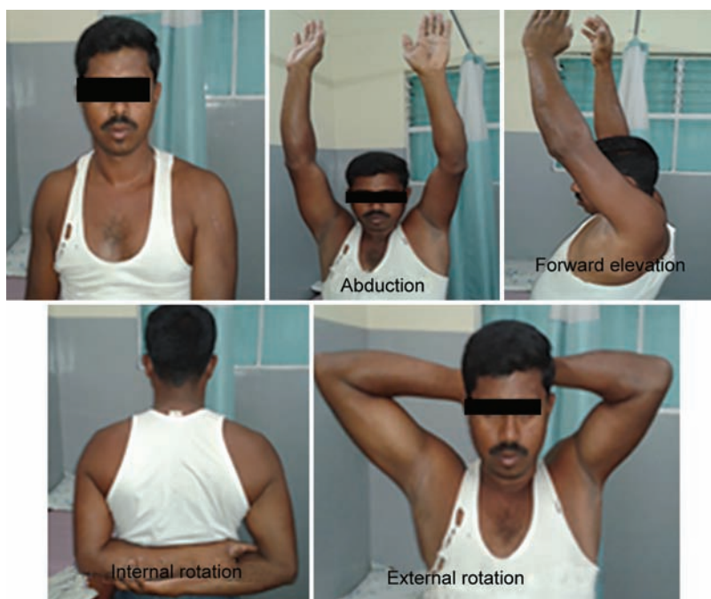
Fig. 1: Clinical illustration