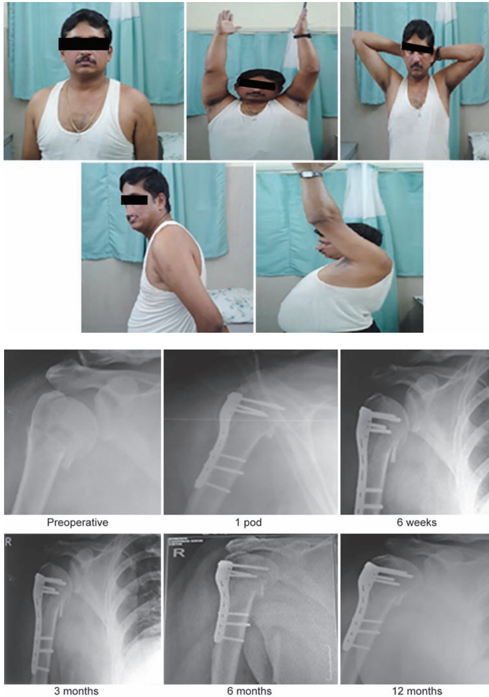
Fig. 3: Patient 2

However, the best management in these injuries is still uncertain and debatable. 18 Hatzidaki et al studied the outcomes of 38 patients who were treated with locked angular-stable intramedullary implant fixation for 2-part surgical neck fractures. He did a follow-up for a minimum period of 12 months. All fractures healed primarily. The mean Constant score was 71, which was a mean age-adjusted Constant score of 97%. In their study, patients could do an average forward elevation of 132° and Constant pain score was 13 (15 = no pain). In their results, 37 (97%) of 38 patients had satisfactory score. Only four patients (11%) were reoperated. 18