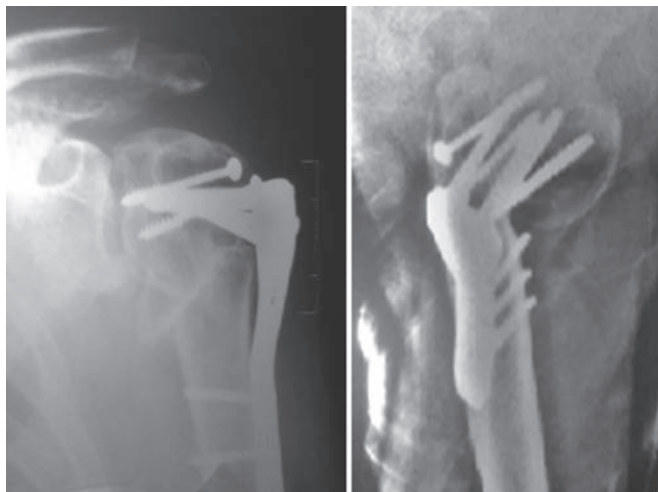
Fig. 4: Avascular necrosis

If the fractures are well reduced and stabilized until healing has occurred, it will usually end up with satisfactory results. This depends on the type of fracture, the quality of the bone, and the technique of reduction and fixation. The experience and skill of the surgeon also count.