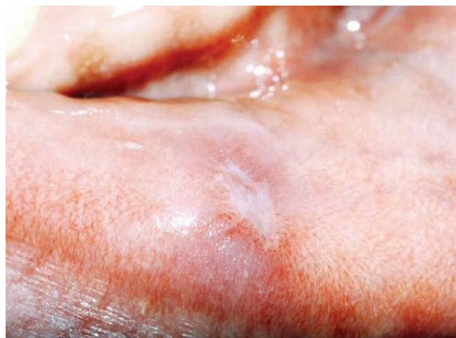
Fig. 4: Two weeks after the surgery, minimal scar was observed