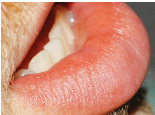
Fig. 5: The healing was uneventful. Natural lip line was reestablished

oral mucosa from unintentional night biting. After consultation with the patient, we recommended extirpation of the tumor with Er,Cr:YSGG laser. The procedure was done infiltrating perilesional local anesthesia using 4% articaine with 1:100,000 adrenaline. First, the lesion was