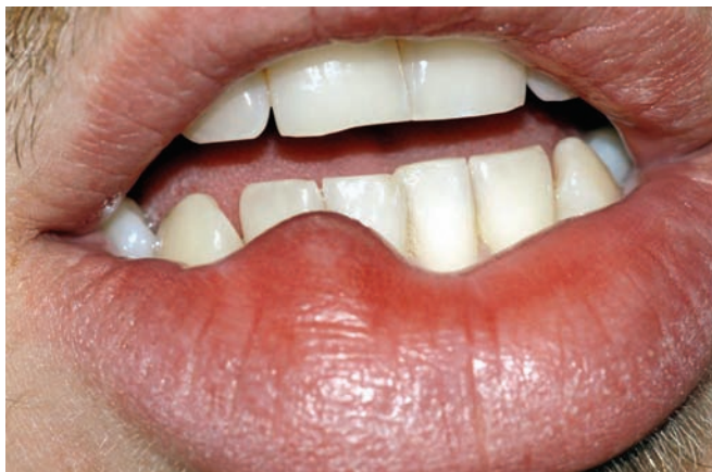
Fig. 1: Lower lip mucocele before the treatment